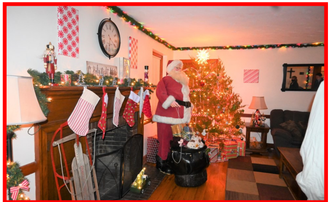
Darling Cottage was the winner for inside and outside decorations and for the most beautiful Christmas tree.