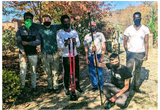
Students helping set up a festival of lights

implemented this year, the Boys Home Key Club has had limited volunteer opportunities. Members assisted our sponsoring Kiwanis Club with updating the local YMCA playground. Several members also helped set up an outdoor festival of lights for the Clifton Forge School of the Arts. Members are anxious to begin volunteering in our community as soon as it is safe to do so!