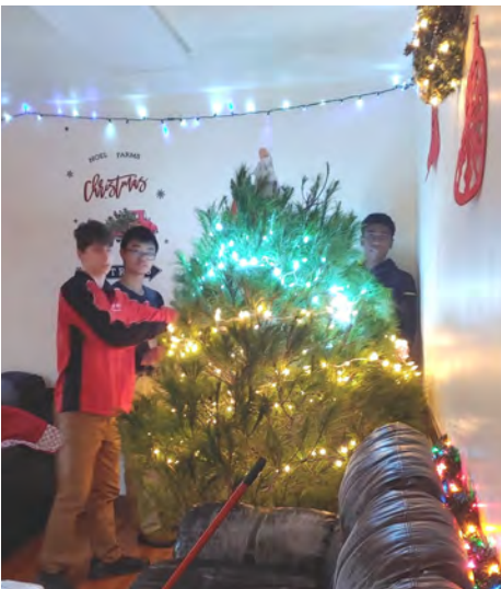
Whitehead residents decorate their Christmas tree