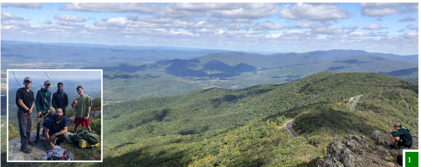
Below: The hikers take a break, and Finn appreciates an incredible view.