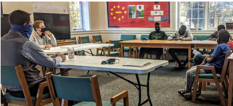
Students at a recent student council meeting

regarding the Boys Home community and then bring legitimate issues or concerns to the entire council for discussion. Requests or concerns are then presented to the staff for approval or further discussion. A sampling of approved requests includes changing work program hours, extending bedtimes on Fridays and Saturdays, and allowing students to ride bicycles and scooters to class.