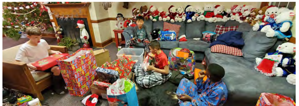
Students in Brown cottage open gifts in their pajamas